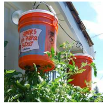
Buckets can hang anywhere convenient - you could even rig up a trickle watering system!

In the early days, check that the stem is growing out from under the bucket, not